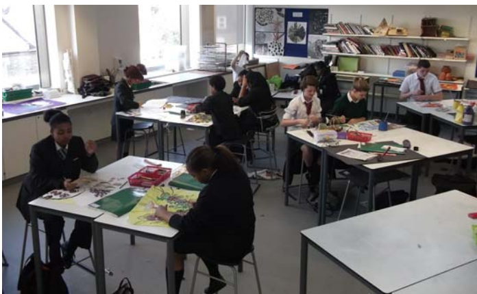
15 students completing Art controlled assessment .... 6 still there at 5.30pm!

*English and Maths appear as second subjects because they are important – so all intervention is timetabled during the school day.